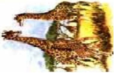
By Cheryl Tice June 2003