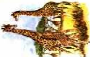
By Cheryl Tice June 2003